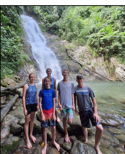
We visited this gorgeous PNG waterfall.