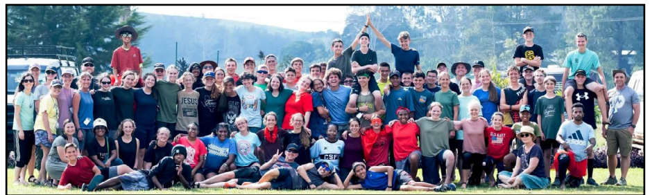
The teens of Ukarumpa - a great bunch! (and four Taylors are in there somewhere)