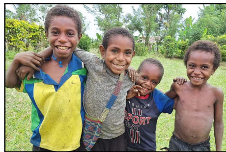
Some of the Nukna kids who will be served by this new literacy teacher training.