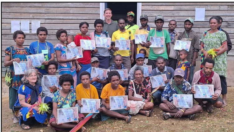
Newly trained literacy teachers, ready to teach Nukna children!