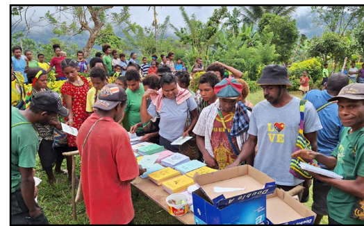
above: Lining up to get copies of Nukna story books. below: Some of the many early reading books we provided to Nukna elementary schools.