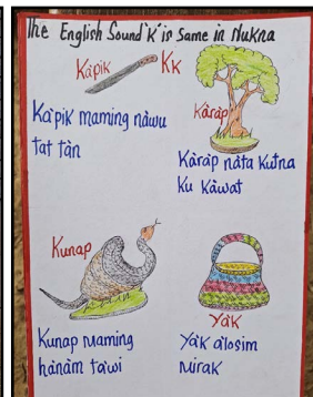
The trainees made these colorful cards for each sound in the alphabet.