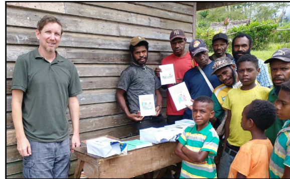
We printed Scripture story books in the Nukna language to help people practice reading before the New Testament comes. Below, Nukna kids are enjoying one of the new books.