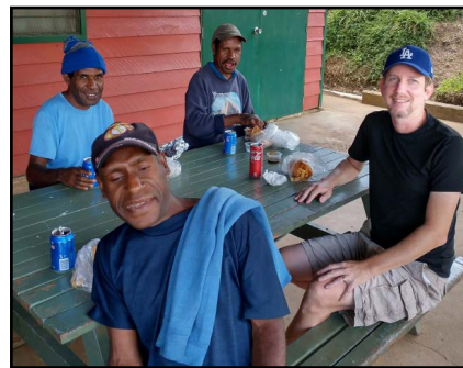
Nukna translation teams came to Ukarumpa in January (left) and February (right).