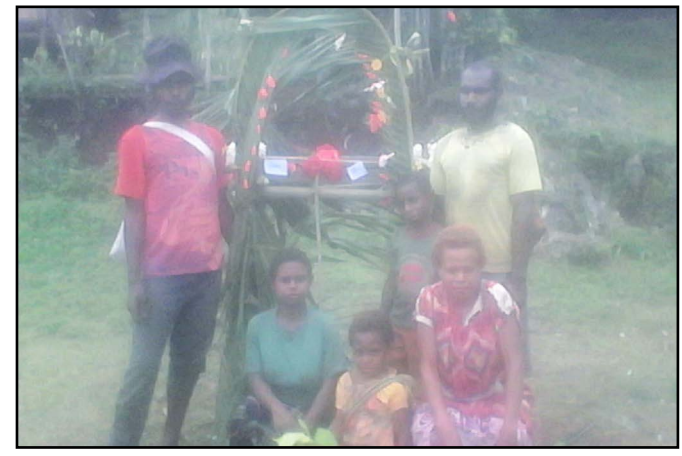
Sunde villagers stand with the platform made with wood from the storm tree.

The Bible study leaders asked the people, Who has more power, God or the spirits? Who is able to control the weather and send rain or withhold it? The group looked up verses such as Matthew 5:45, "He sends