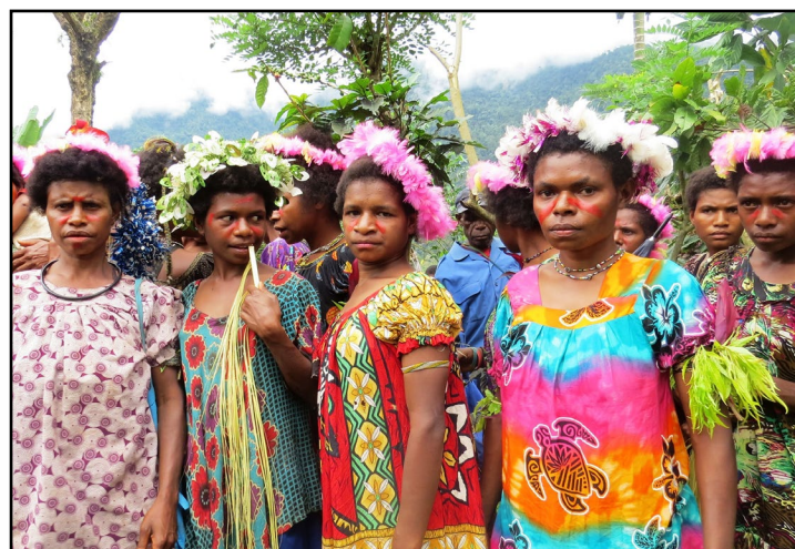
Nukna women ready to sing-sing