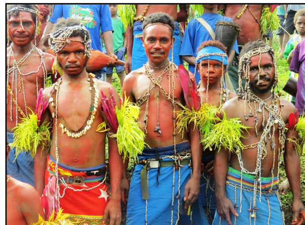
Nukna youth dressed up for a traditional sing-sing

Want to see and hear these Nukna sing-sings for yourself? We’ve put together a short video - just click this link!