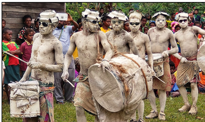
Young men from Hamelengan village painted themselves with mud and formed a marching band