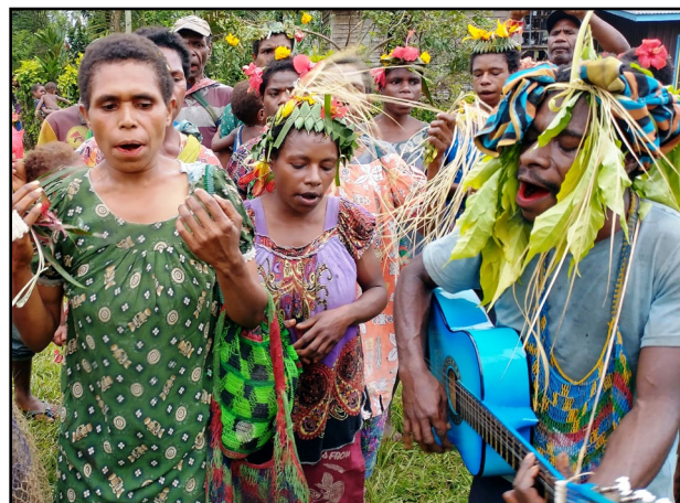
The people of Apalap sang a special song to us as a thank you