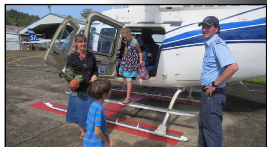
Getting out of the chopper after being turned back by the volcano