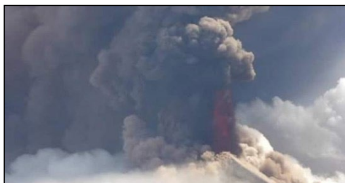
Mt. Ulawun erupting

Our whole family was planning to spend two weeks in the Nukna area, in our home village of Hamelengan, just prior to the Bible study course, but in a dramatic turn of events, Mt. Ulawun on New Britain island began erupting the day before our flight. Even though this volcano is about 300 miles away from the Nukna area, its smoke plume was blowing in our direction. However, the pilots thought the chances were good that we could still fly out there the next morning, so we proceeded with our plans. Traveling by helicopter, we were about 80% of the way there when we flew through a mountain pass and saw an unusual dark haze filling many of the valleys ahead of us. The pilots