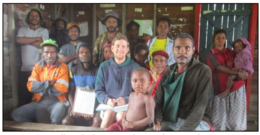
Village checking six Pauline epistles in October