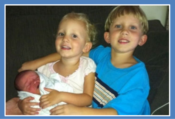
It's a Boy!!