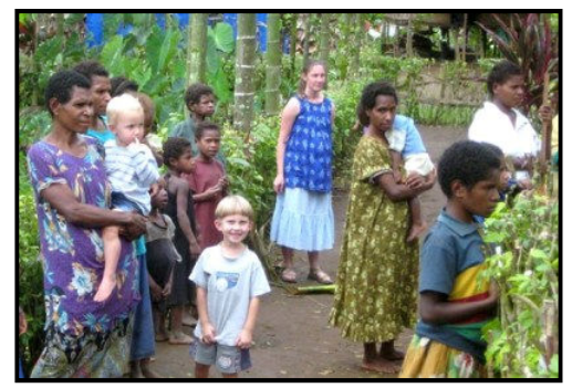
Hanging out with the conference crowds.